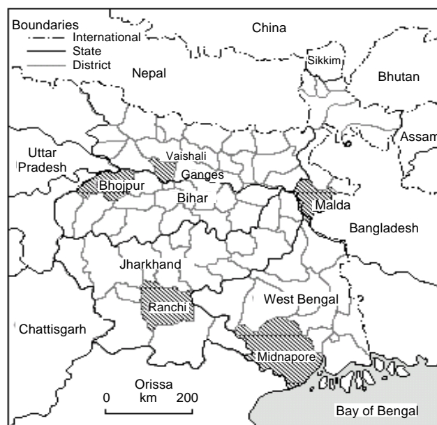
Figure 1: Location of the Field Districts: Bihar, Jharkhand and West Bengal

Kohli – that the government would perform better from the point of view of the rural poor in West Bengal than in neighbouring Bihar (a state widely assumed to be caste-ridden, mismanaged and prone to rent-seeking and even looting: Das 1992) – but the emphasis was laid on the field testing of particular government policies. Rather more important than this first hypothesis, however, was a set of hypotheses that followed from our reading of another literature on the functions and spatialities of the state. Kohli's work paid surprisingly little attention to the performance of the Left Front regime across the districts of West Bengal, and his accounts of poverty reduction were mainly confined to conventional indicators like wages and incomes earned, and calories consumed. Our reading of the work of Paul Brass (1997) and the World Bank (2000, 2001), among others, encouraged us to think of the needs of the poor in broader terms and with regard to four major functions of governance: what we have called the developmental, empowerment, protective and disciplinary functions of the state.